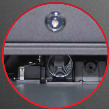
High quality spring