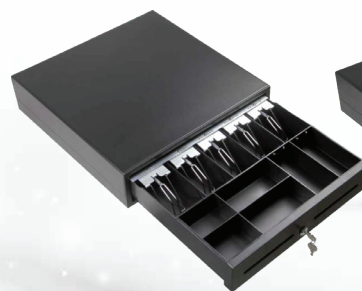
5 B6 C

Pleasant cashier two colors, multiple options adjustable coin slots, 4 or 8 as you like